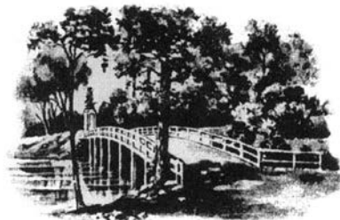
OLD NORTH BRIDGE