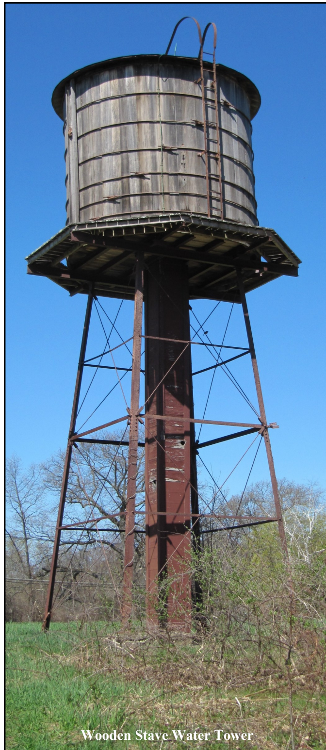
Wooden Stave Water Tower

Division of Natural Resources 141 Keyes Road Concord, MA 01742 Tel: 978.318.3285 www.concordma.gov