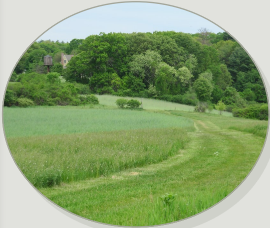
View across Mattison Field