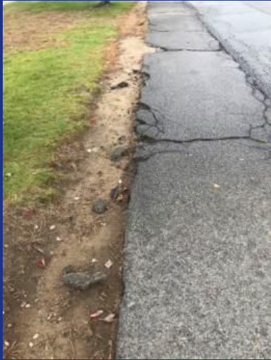
Broken and spalled pavement on sidewalks