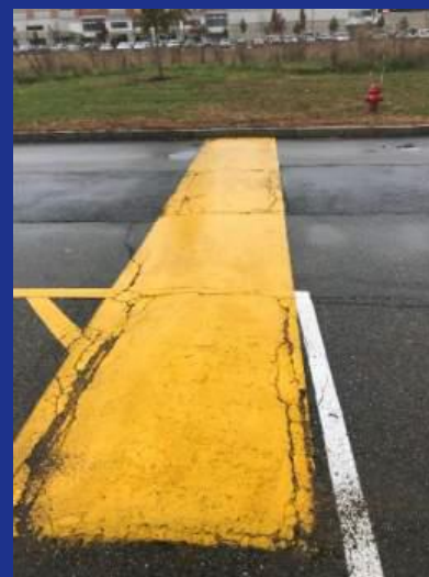
Multiple patches and significant cracking