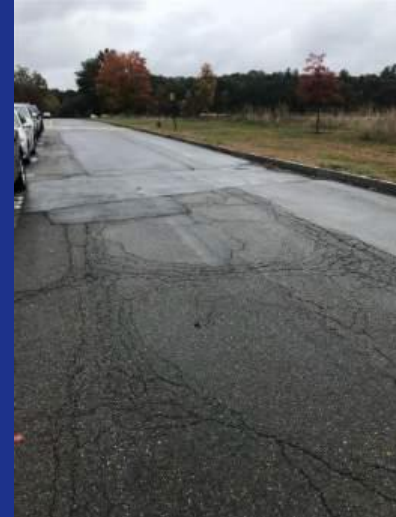
Multiple patches and significant cracking

Concerns have continued regarding the safety of the road and the sidewalks and limited ADA Accessibility