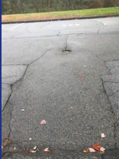
Sunk utility covers