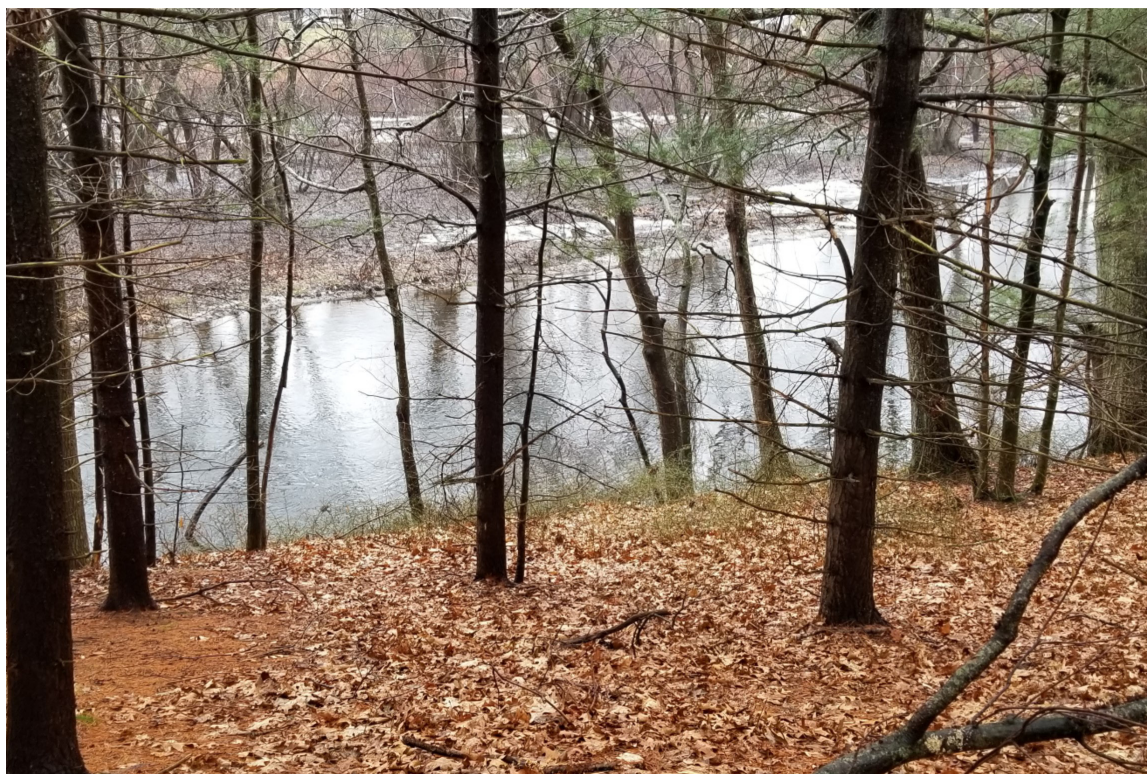
View from Assabet River Bluff, West Concord

The Land Trust is governed by a volunteer board and our operations are supported almost exclusively by annual membership donations. The Land Trust is grateful for the many residents of Concord who have been so generous in donating land, conservation restrictions on land, and the funds necessary to acquire and maintain conservation land. As one of the oldest local land trusts in the country, we are proud and grateful that Concord has long placed a high value on maintaining a balance of land uses characteristic of the traditions of a New England town. The Land Trust is committed to continuing this tradition by protecting and stewarding these special places, for Concord residents and all to enjoy in perpetuity.