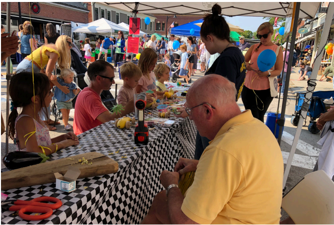
A busy veggie car decorating and racing station at the Agriculture Committee's annual Ag Day Farmers' Market.

the expanded veggie race track and veggie decorating activities were able to be enjoyed by more families than ever before. In addition to the festivities on Main Street, the Concord Free Public Library partnered with the Concord Conservatory of Music to host a free outdoor concert on the library lawn in celebration of Ag Day.