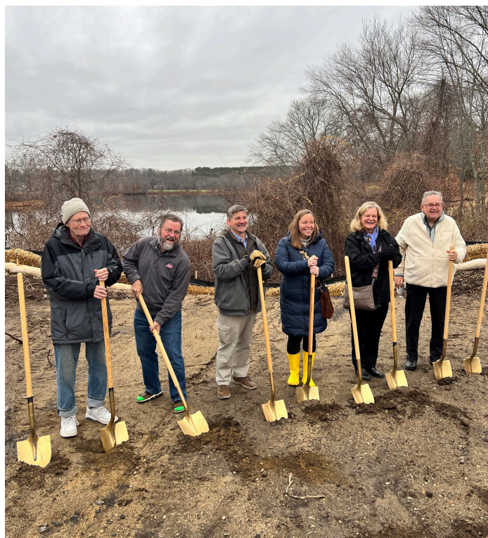
Habitat for Humanity ground breaking: November 30, 2022