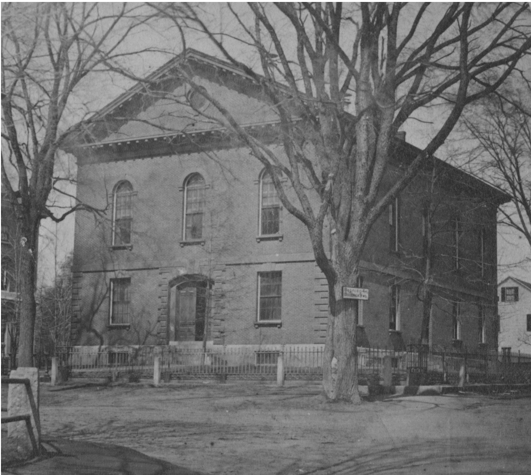
Town House - Concord, Massachusetts 1875