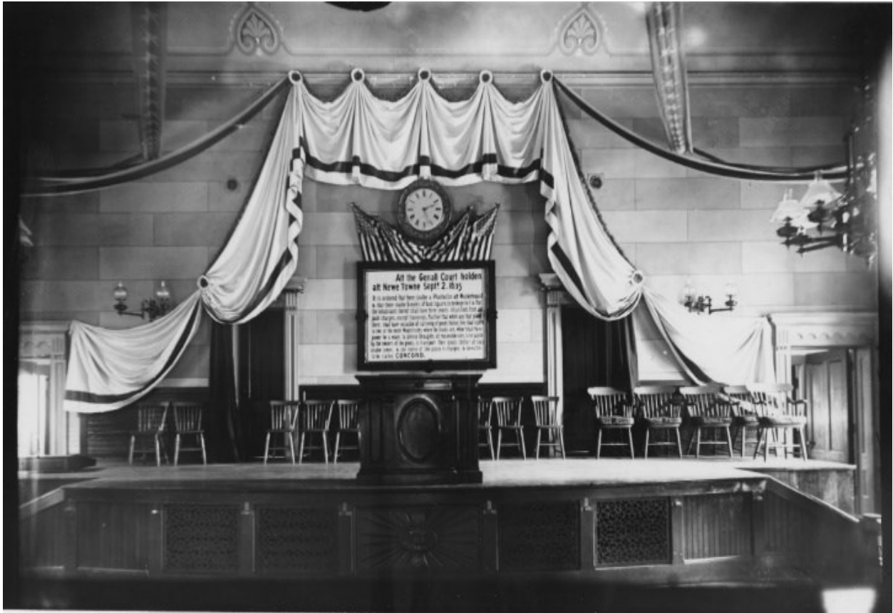
Town House Function Room, late 1800s.

By printing in black and white and placing the Warrant online we cut our production cost by 50%.