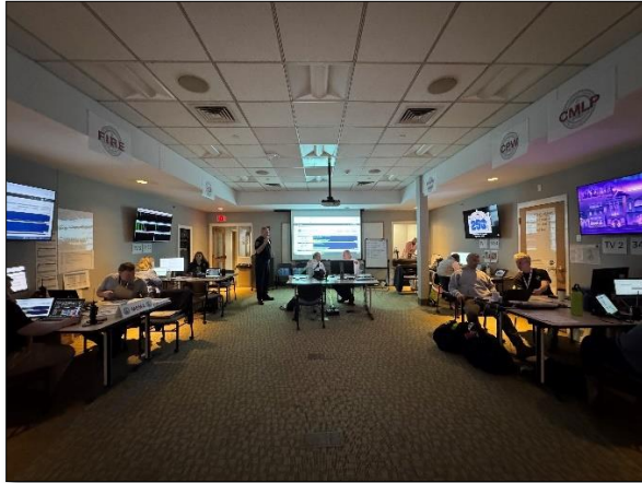
Emergency Operations Center

All this work was done in the Town's new backup emergency communications center, which demonstrates the team's ability to quickly adapt and provide consistent service despite the circumstances.