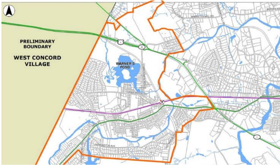
Above: West Concord Historic Resource Survey Study Area, 2013