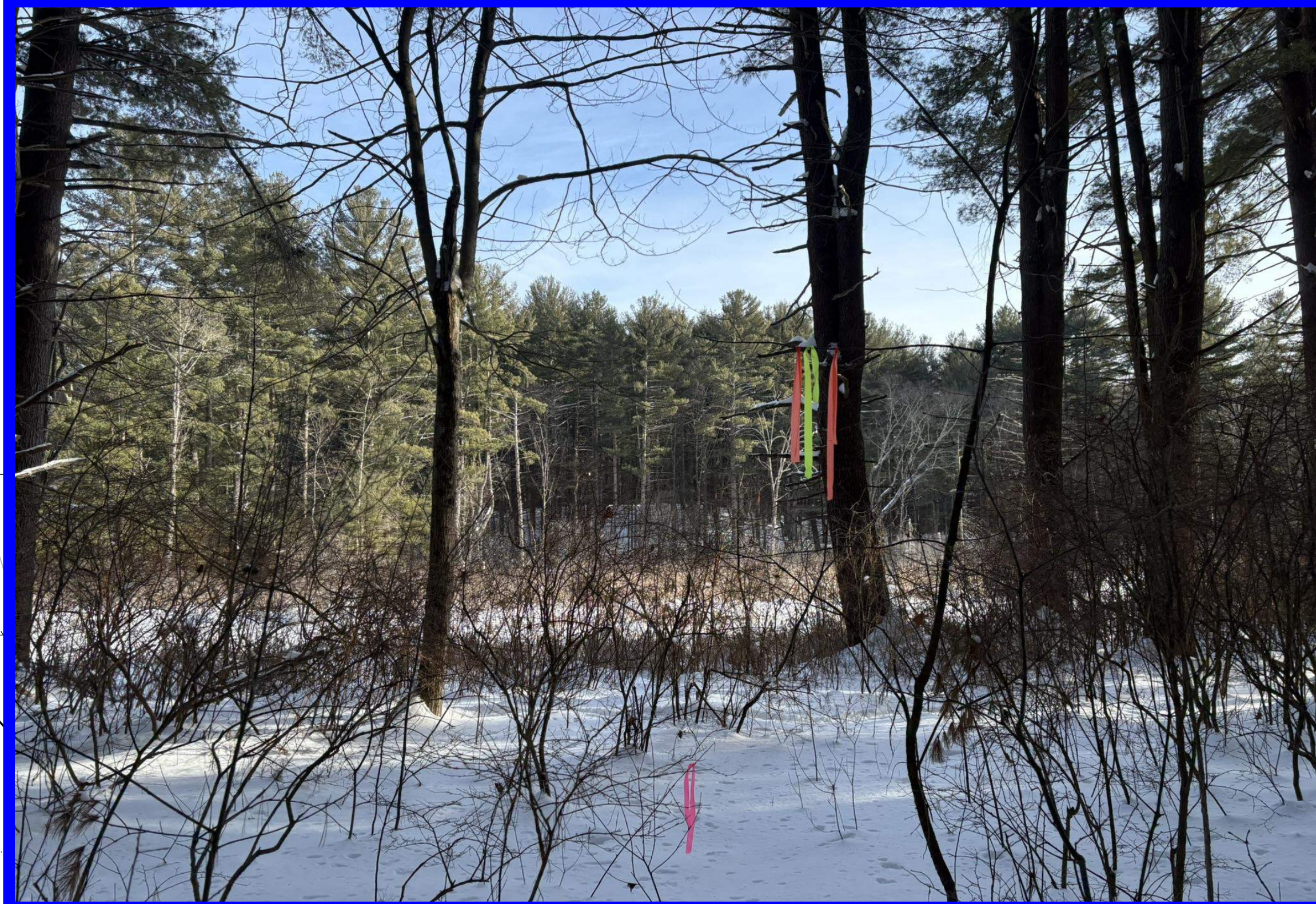
View of beginning of boardwalk with orange and green flags