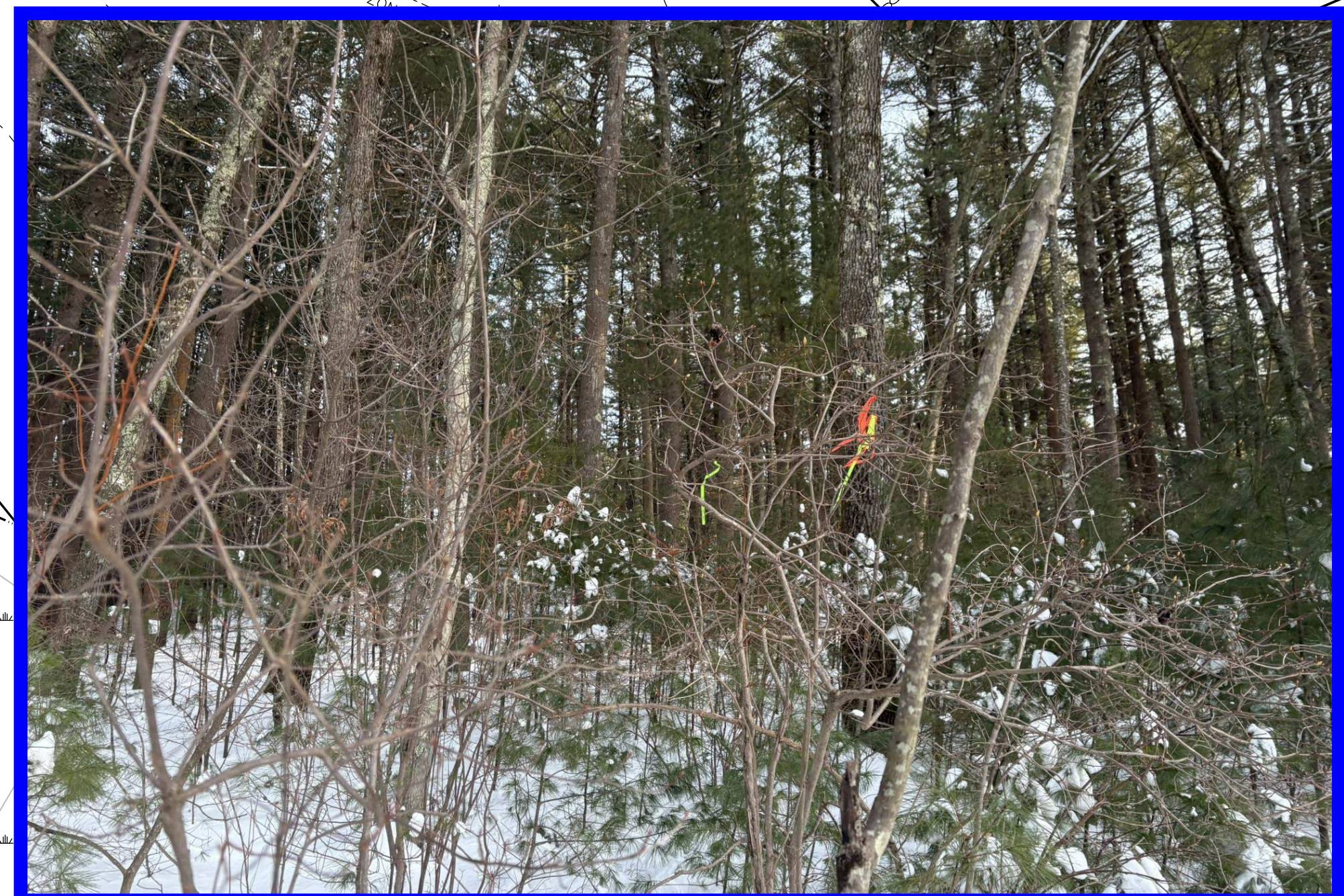
View looking up towards proposed path with orange flag