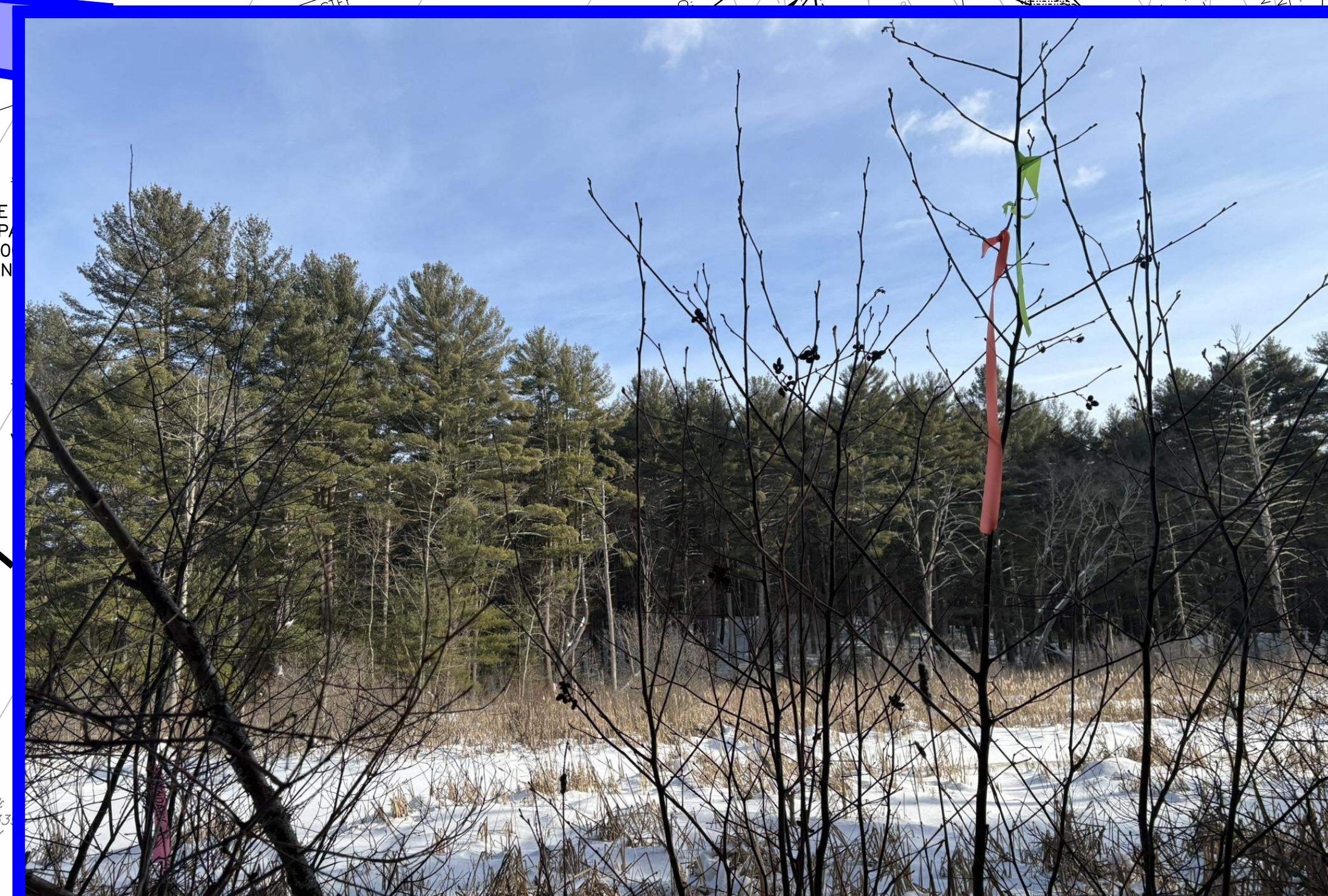
View proposed crossing with orange flag