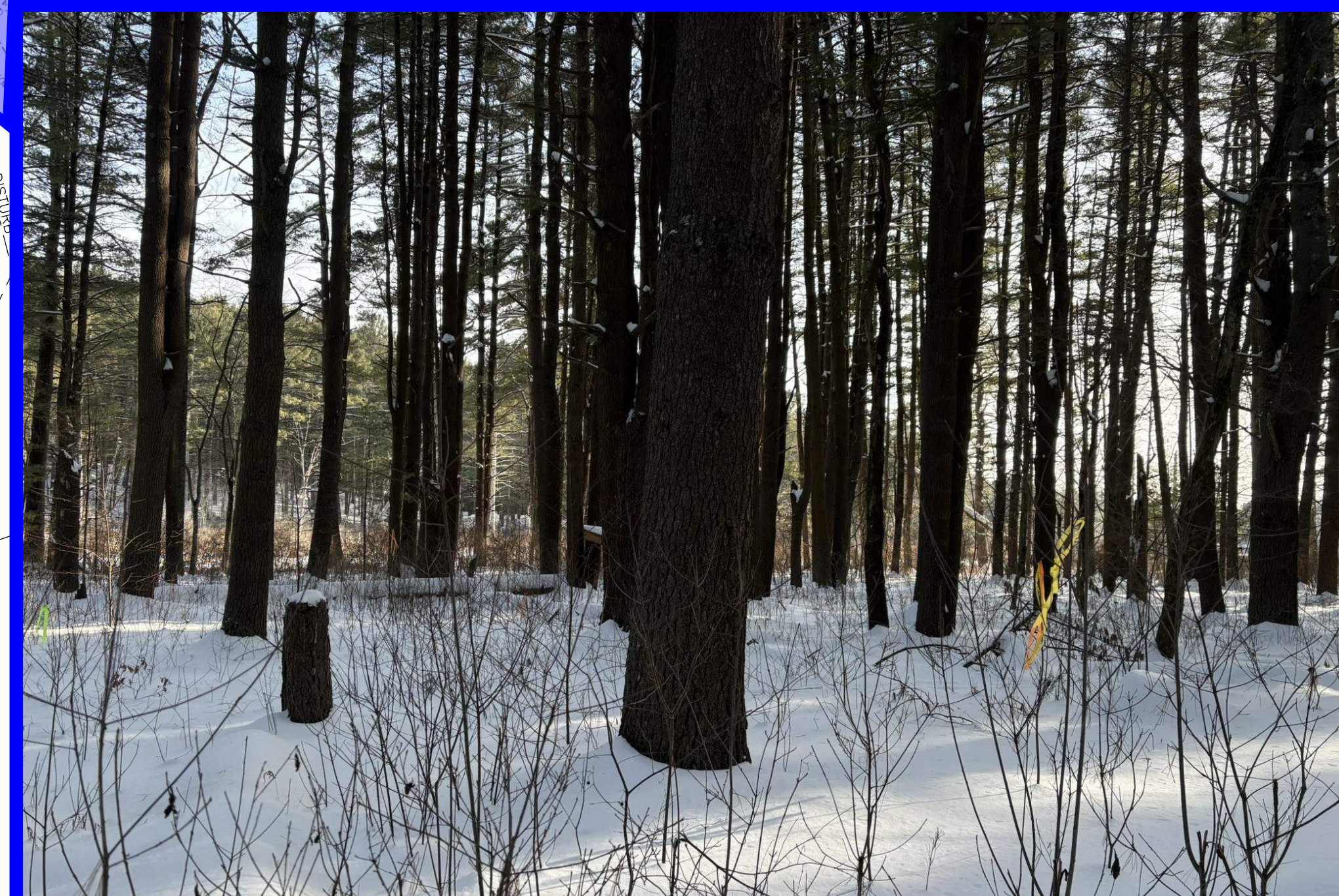
View of proposed path to the right with yellow flag