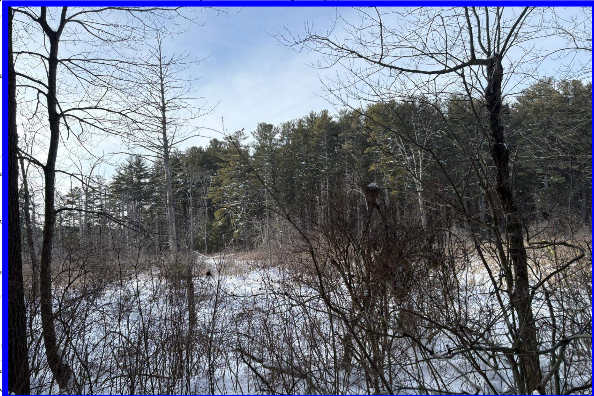
View of proposed crossing area/Spencer Brook