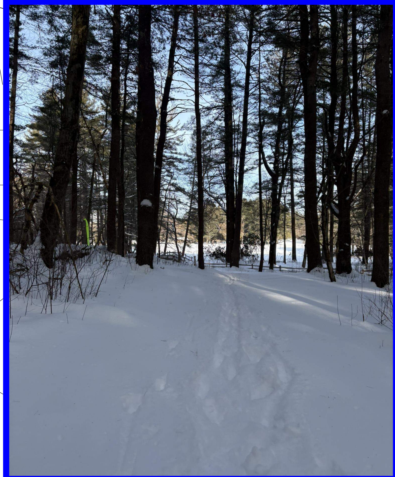
View left of proposed path

AND SHALL ESS D SITE. AN AREA AREA, THE DED, THIS S (ROOTS, VEGETATION IAL BEING TIES AND TED USING ROUGHOUT IDENTIFYING WO YEARS