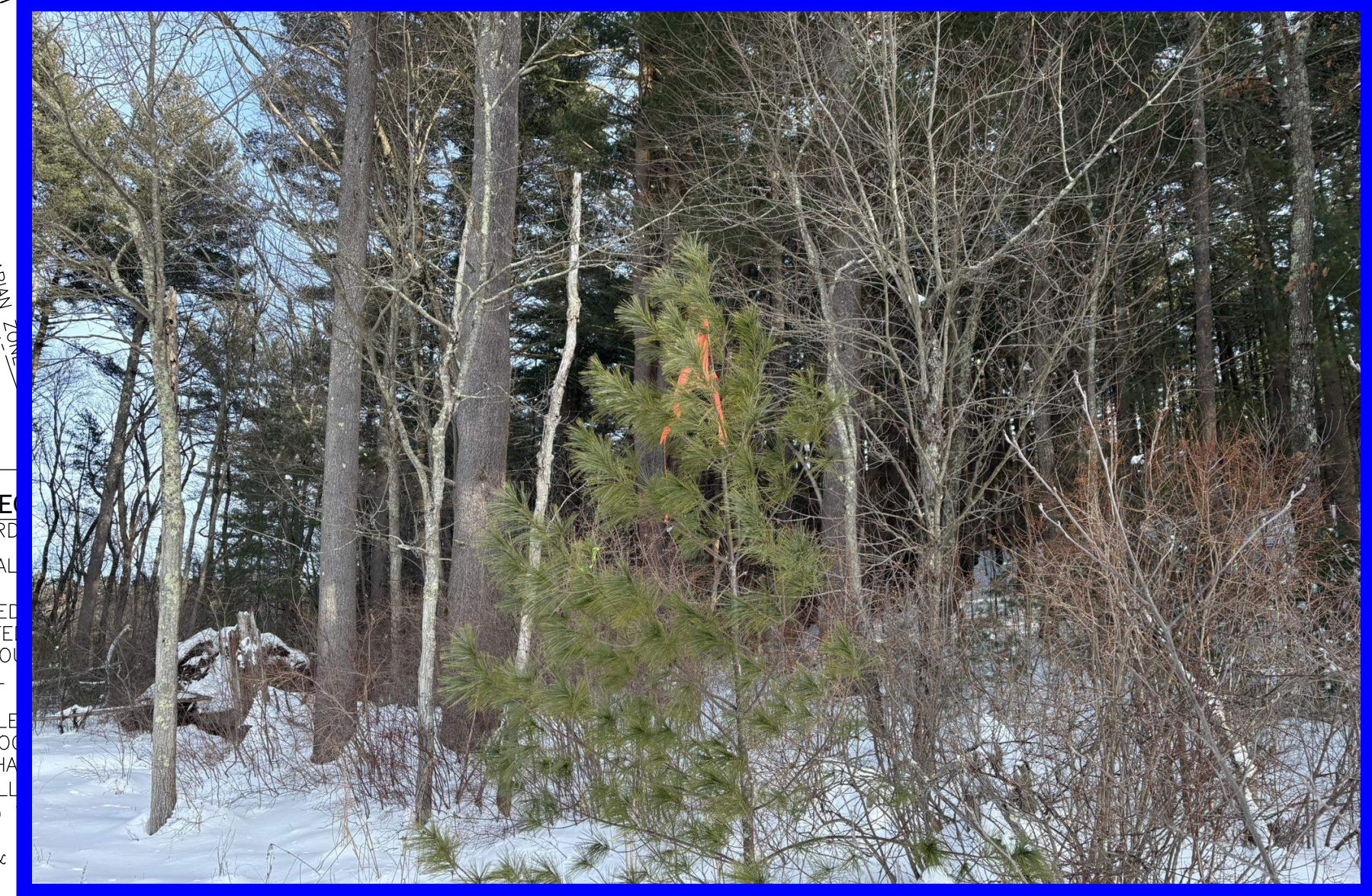
View looking up at proposed boardwalk with orange flag