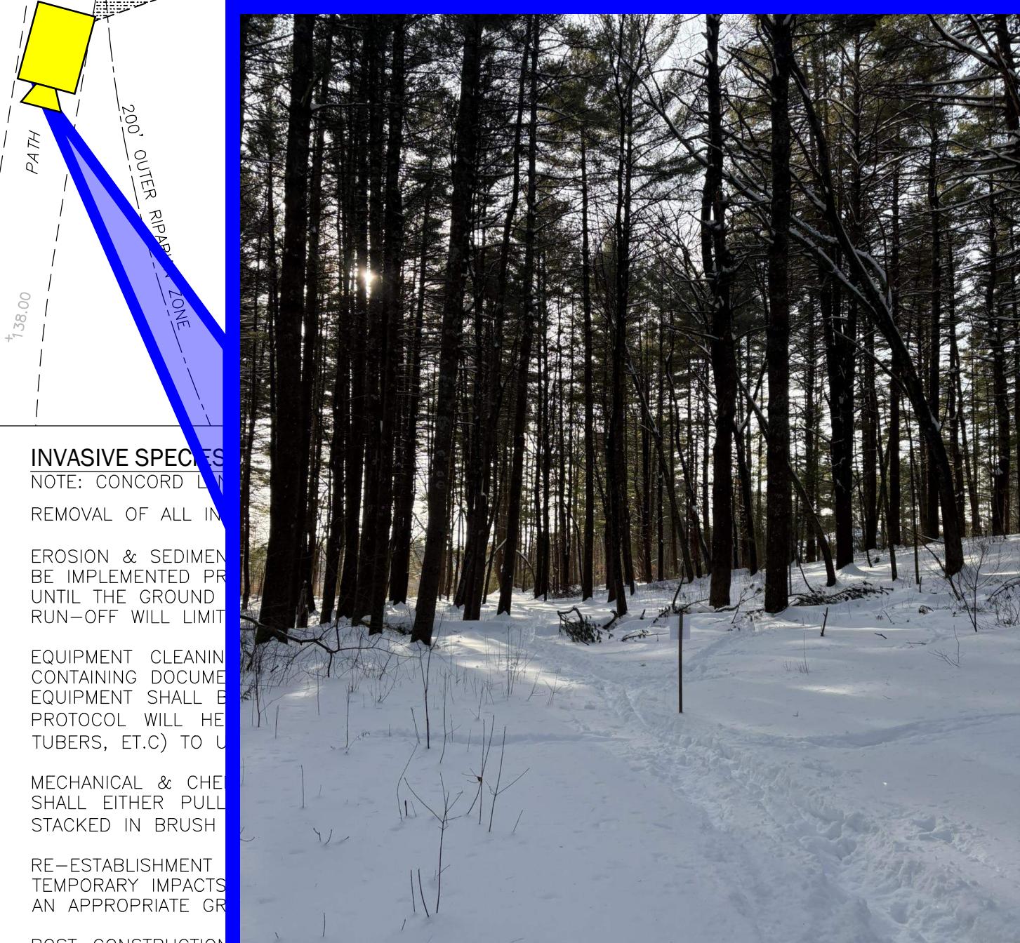
View right of proposed path