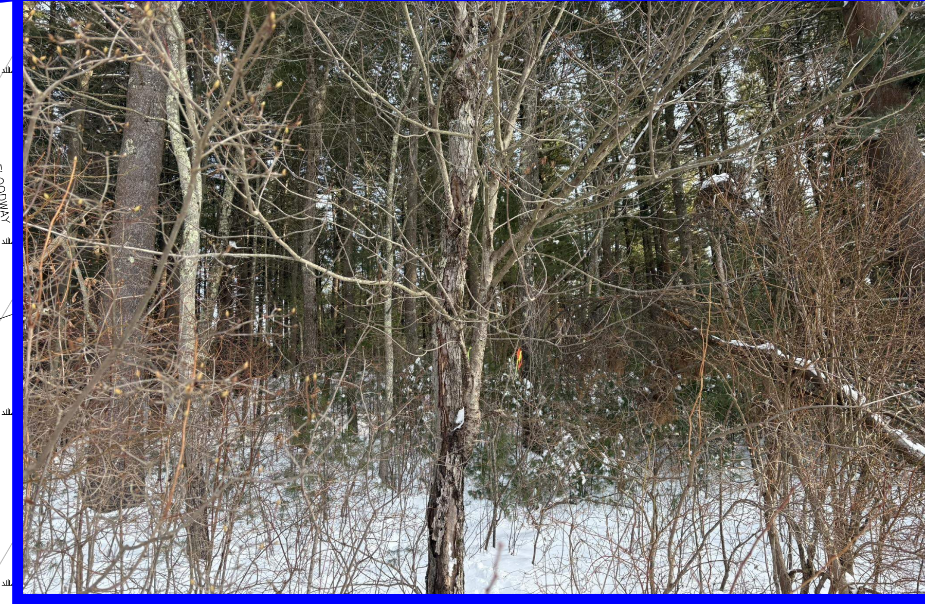
View looking up at proposed boardwalk with orange flag