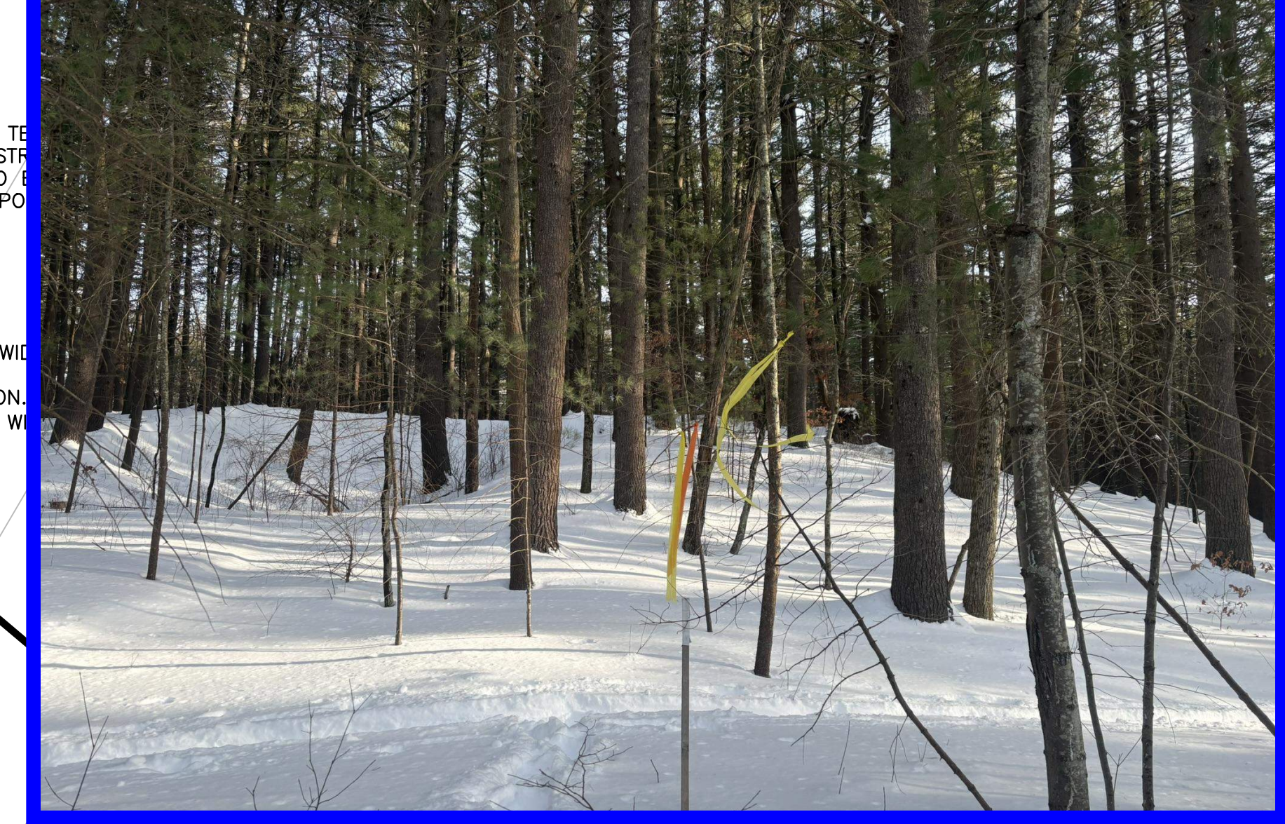
View of stake denoting proposed path

INVASIVE SPECIES REMOVAL NOTE: CONCRETE REMOVAL OF ALL EROSION & SEDIMENTATION SHALL BE IMPLEMENTED UNTIL THE GROUND RUN-OFF WILL BE STABILIZED. EQUIPMENT CONTAINING OIL OR OTHER HAZARDOUS MATERIALS SHALL BE CLEANED AND WASHED AT A DESIGNATED WASH STATION. MECHANICAL & ELECTRICAL EQUIPMENT SHALL EITHER BE STORED OR REMOVED FROM THE SITE. RE-ESTABLISHMENT OF VEGETATION SHALL BE COMPLETED WITHIN 90 DAYS OF PROJECT COMPLETION.