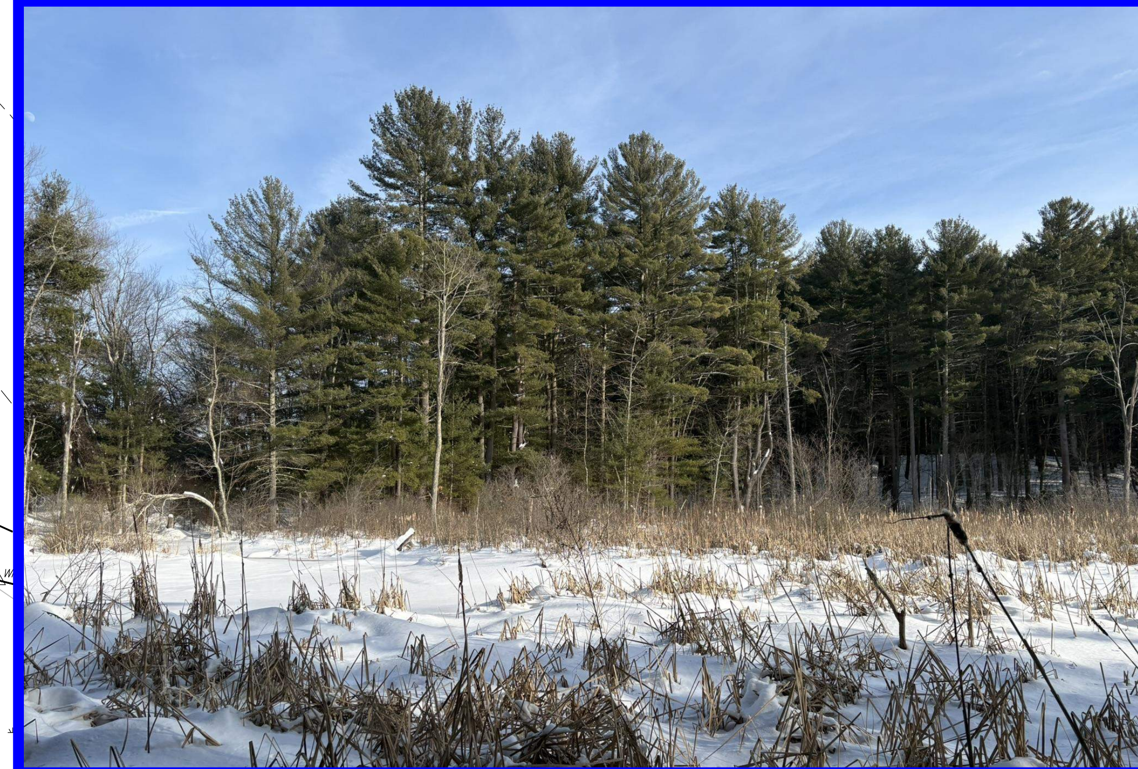
View of proposed boardwalk crossing/Spencer Brook